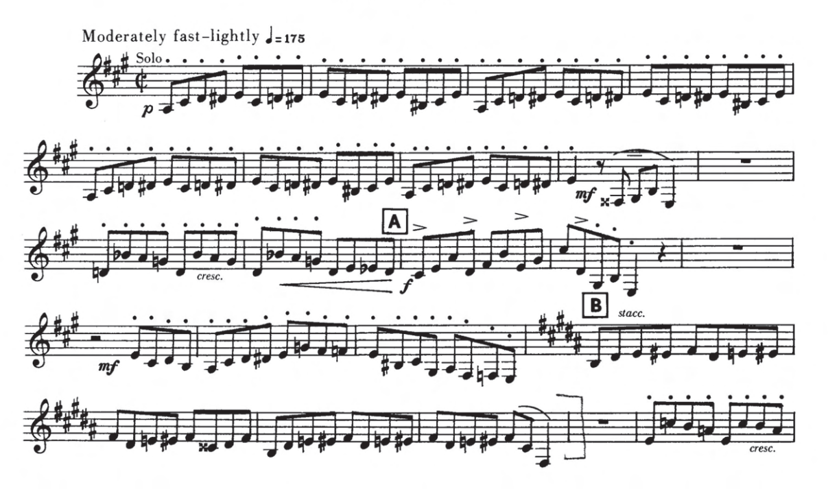
3. On the Trail