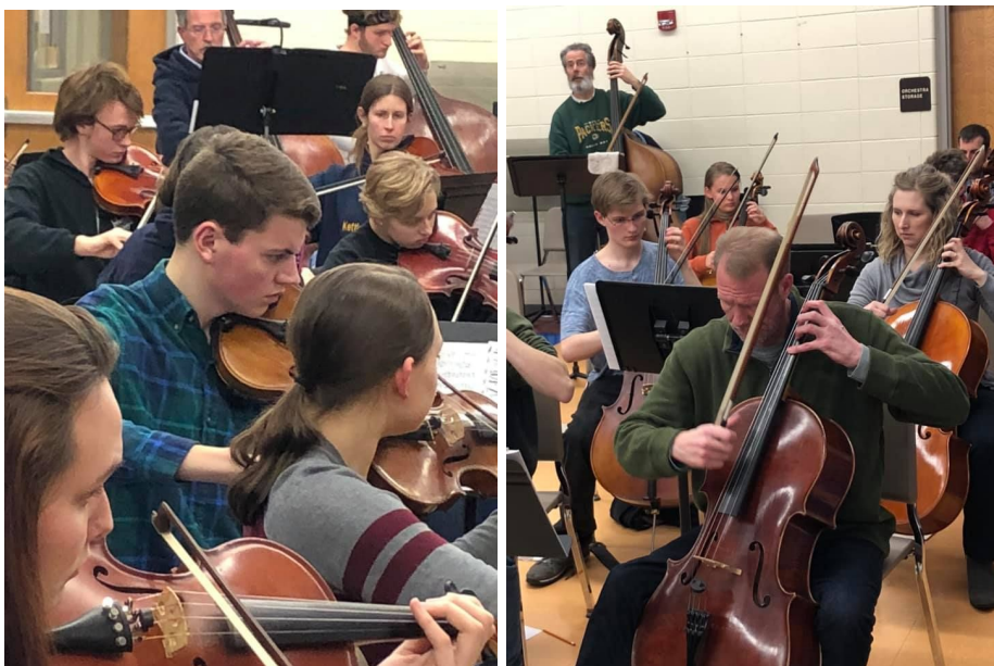
Above: KMS musicians sit alongside high school mentees in their first rehearsal

KMS pairs with West Bend High School students for an unforgettable collaboration